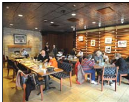
Marion Street Cheese Market

Unique restaurants with live music on weekends; Taverns / Sports Bars; Gastro Pub; Retail such as apparel and accessories