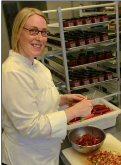
Rare Bird Preserves

7-Eleven, PJ's Ace Hardware, Domino's Pizza, Jamaican Grill, Oak Ice Cream, Rare Bird Preserves, Terra Incognito