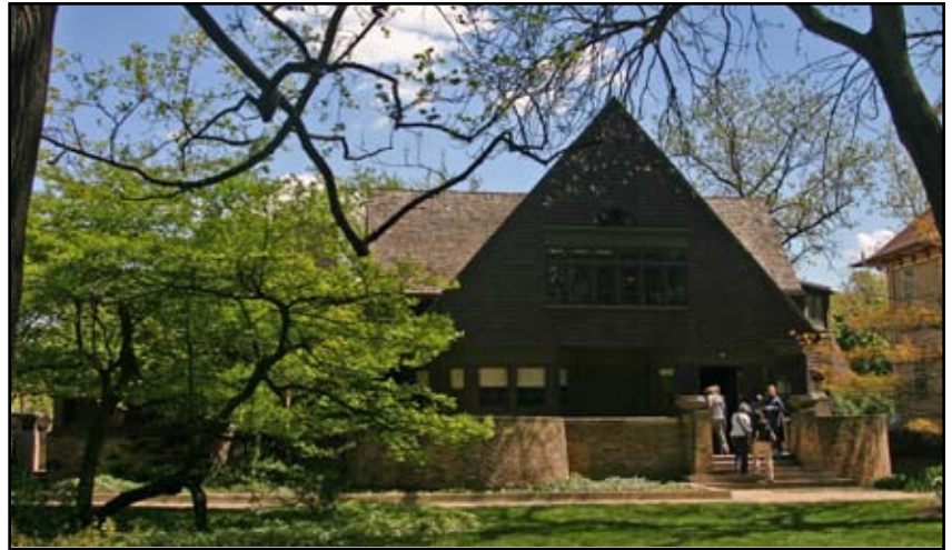
Frank Lloyd Wright Home & Studio

Frank Lloyd Wright Home & Studio – 80,000