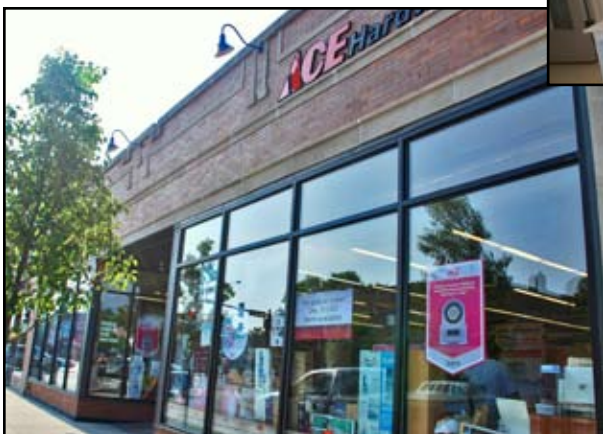
PJ's Ace Hardware