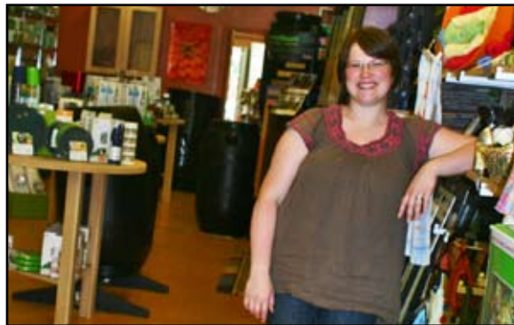
Green Home Experts