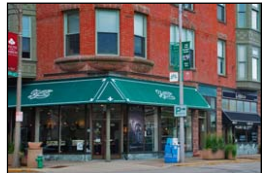
Oak Park Jewelers