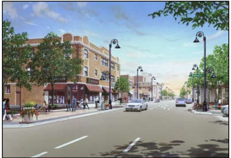
Roosevelt Road streetscape plan. Work begins Summer 2010.

Please visit www.opdc.net and click on "Available Sites & Buildings" for more information on locations available in this business district.