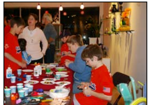
Summer Art Kids Camp at Prodigy Glassworks