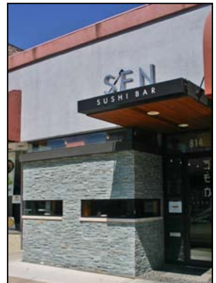
Sen Sushi Bar