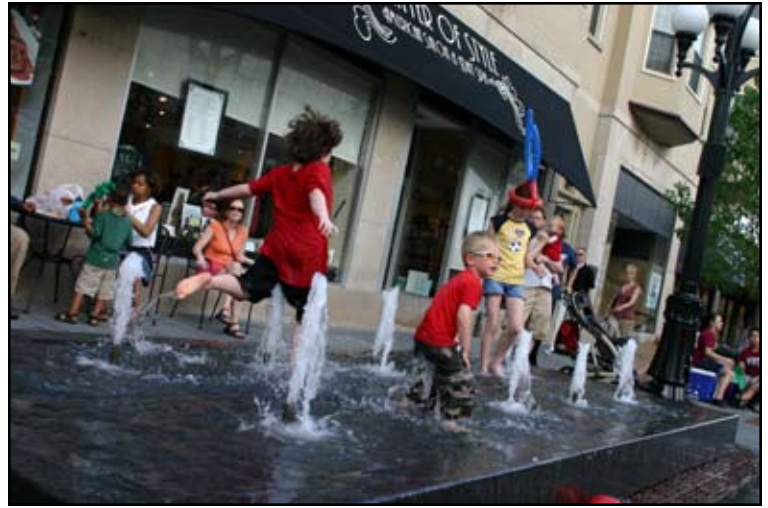
Marion Street Fountain

An approved mixed-use development at Lake Street and Forest Avenue will include a 140-room hotel, 85 condo units, 28,000 sq. ft. of retail, and a 510-space parking garage.