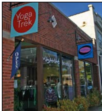
Yoga Trek & Majama's Boutique

Bead in Hand, Briejo, Brown Elephant, Buzz Cafe, East Gate Cafe, La Majada, Majama's Boutique, Prodigy Glassworks, Sirius Cooks, Trattoria 225, Val's halla Records, Yoga Trek