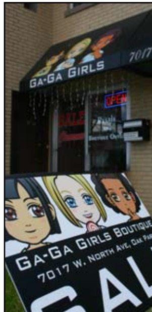
Ga-Ga Girls Boutique

Please visit www.opdc.net and click on "Available Sites & Buildings" for more information on locations available in this business district.