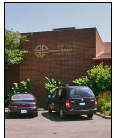
Oak Park Tennis & Fitness Centre