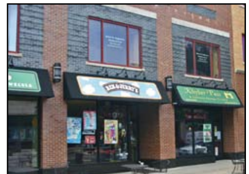
Ben & Jerry's