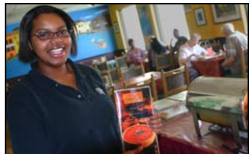
Edwardo's Natural Pizza