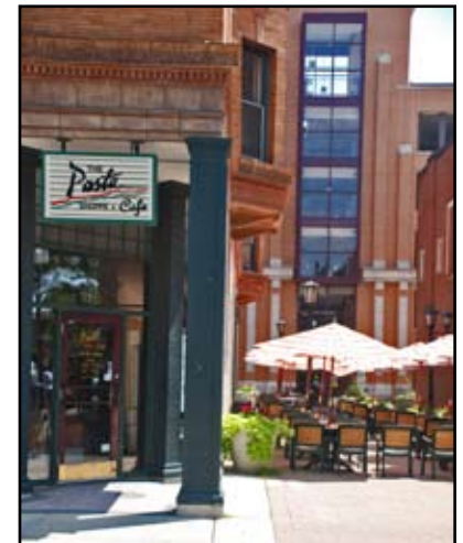
The Pasta Shoppe & Cafe