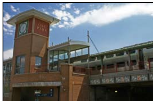
Multi-modal Transit Center