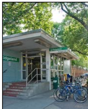
Ridgeland Green Line stop

Pack and mail outpost; Skills/training centers; Child learning / tutoring centers; Repair shops—computers, TV's, jewelry, shoes, alterations; Take-out food in the categories of pizza, chicken, barbecue, sandwiches and soup/salad