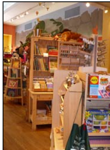
Gepetto's Toy Box

Apparel and Accessories that appeal to teens; High quality dining; Gifts and Specialty Boutiques; Quick serve food uses; Personal technology; Sports Apparel and Equipment; Music