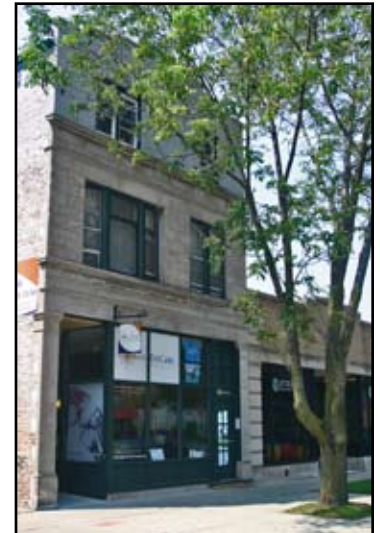
Compass Eye Care

644 W. Madison St. – 56,000 sq. ft. commercial building on 1.79 acres, this is an excellent mixed-use redevelopment site.