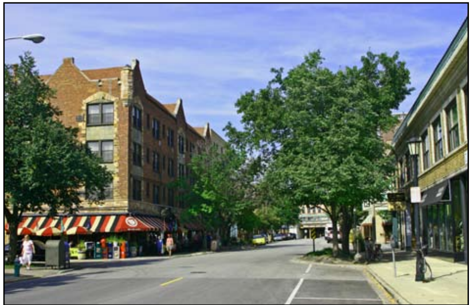
South Marion Street

(average week day passenger trips) CTA Green Line, 3,333; Metra, 1,025