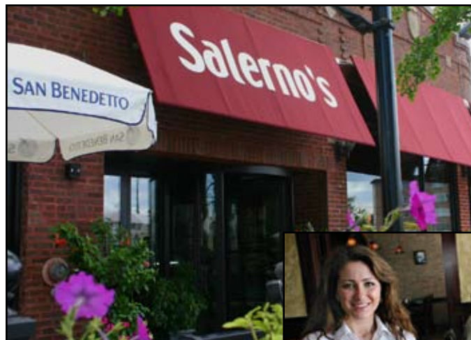
Salerno's Pizza & Pasta