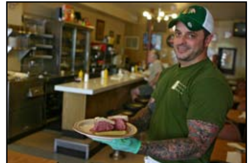
The Onion Roll