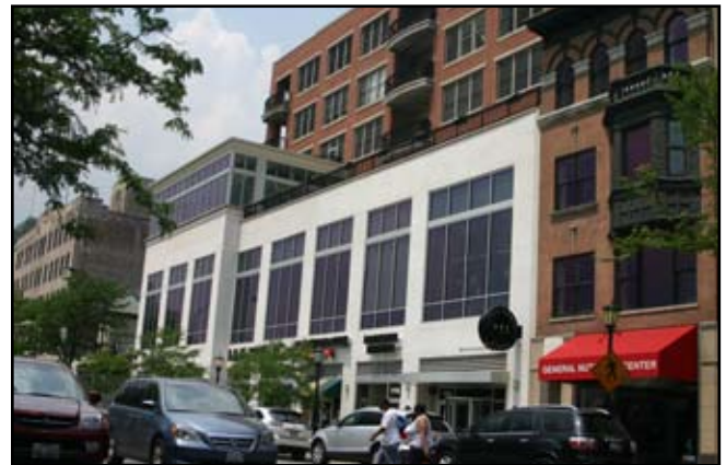
Fitness Formula Club