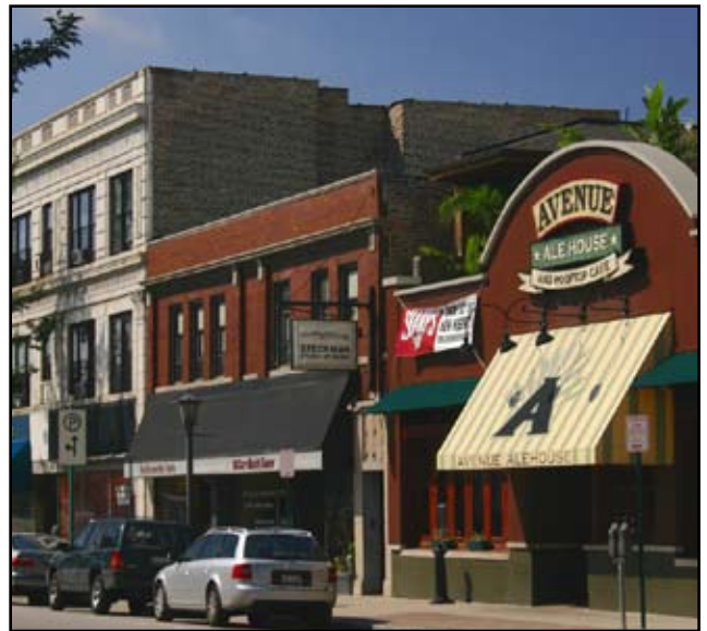
Avenue Ale House

Please visit www.opdc.net and click on "Available Sites & Buildings" for more information on locations available in this business district.